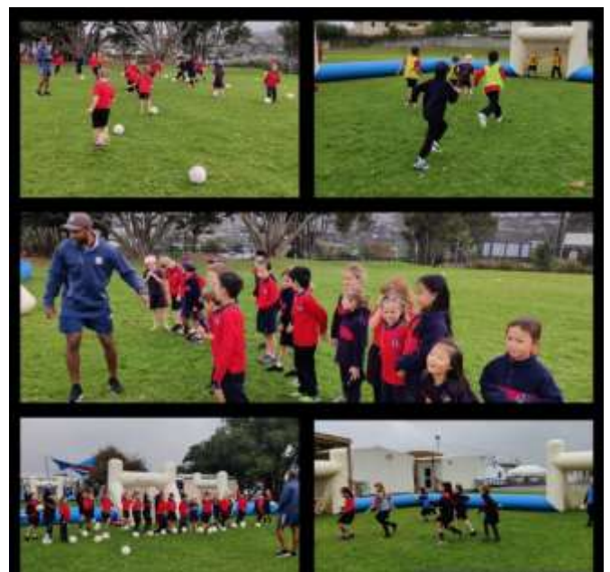
Room 9 Year 1 students showing off their Football skills!