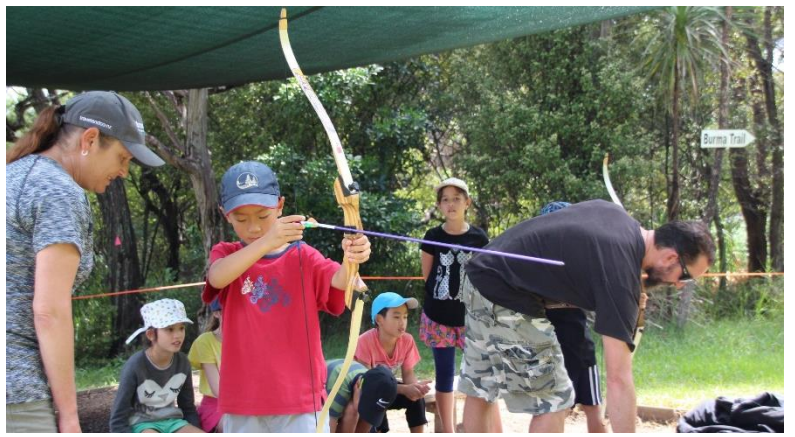
YEAR 5 CAMP – ROOMS 16 AND 22