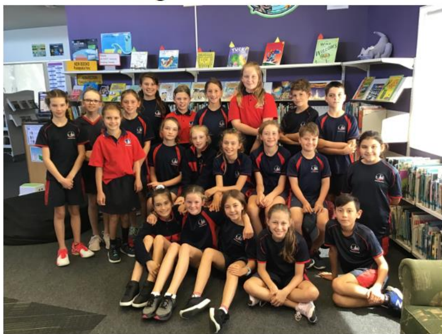
Our librarian team has now undergone their training and are enjoying supporting you when you visit the library at lunchtimes!