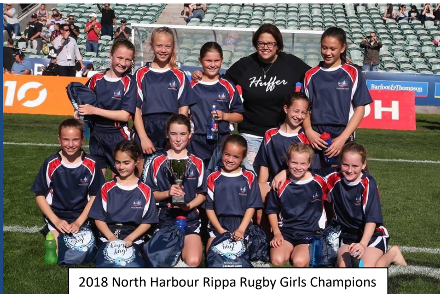
2018 North Harbour Rippa Rugby Girls Champions