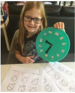
Sierra has been learning to tell the time with the help of a homemade clock made out of a plastic plate.