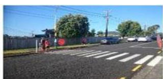
Wait at the crossing