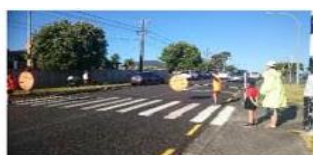
Signs out - wait