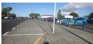
Drop off/Pick up area