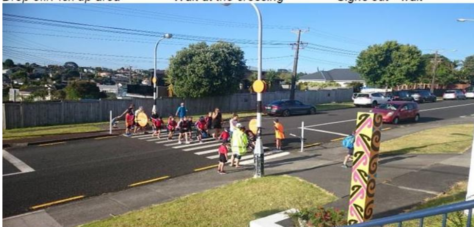
Cross now. Cross at the crossing only.

The safest place to cross a road is at the pedestrian crossings – not at the corner of Browns Bay Road and Masterton Road. The crossings are patrolled by teachers before and after school.